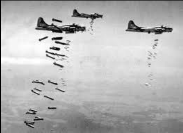
Great Hail from Heaven