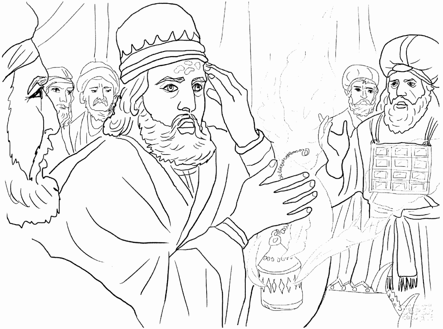
King Uzziah Disobeyed the Lord II Chronicles 26 & II Kings 15:1-7