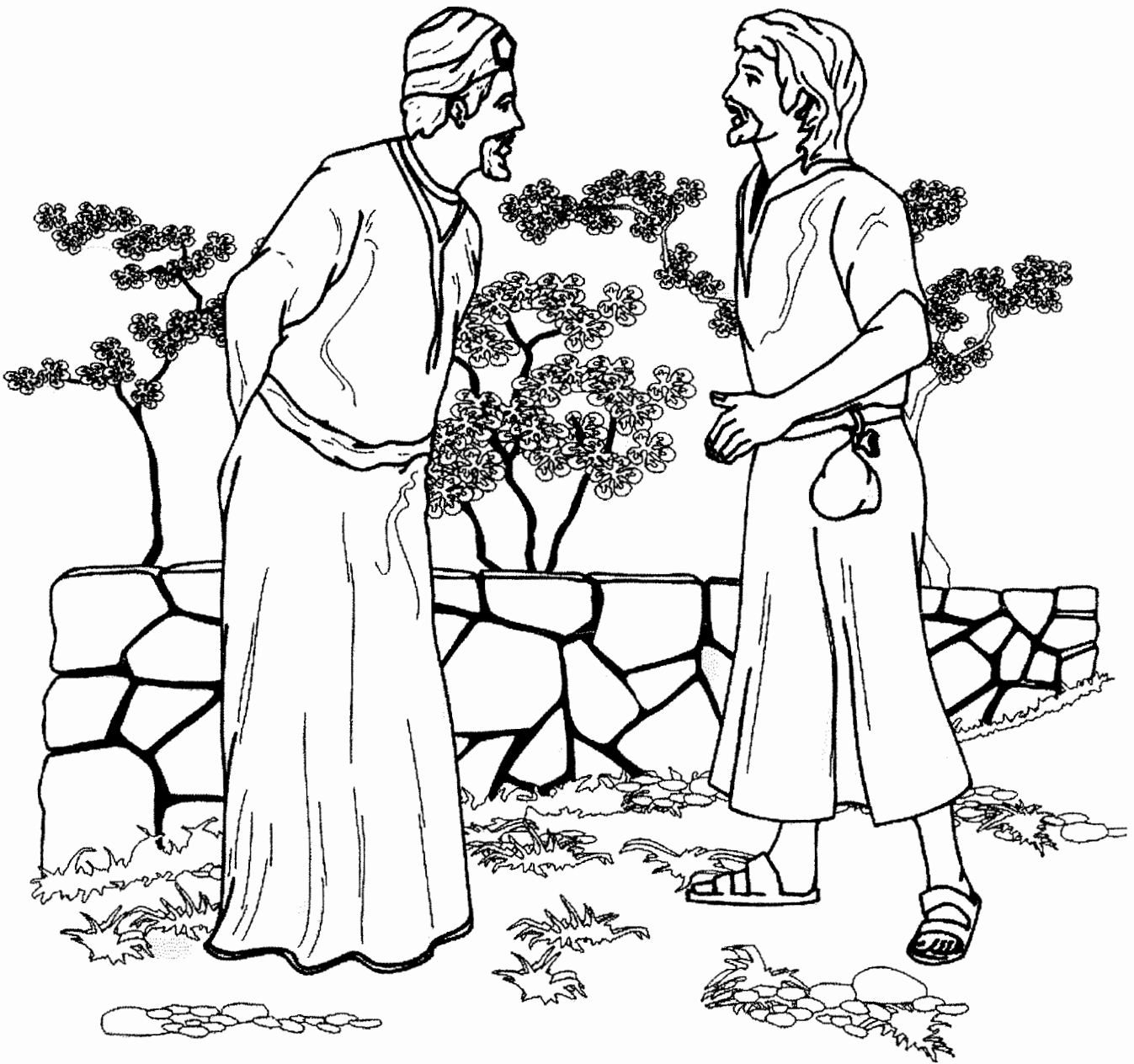
Graphics from Bible Clips