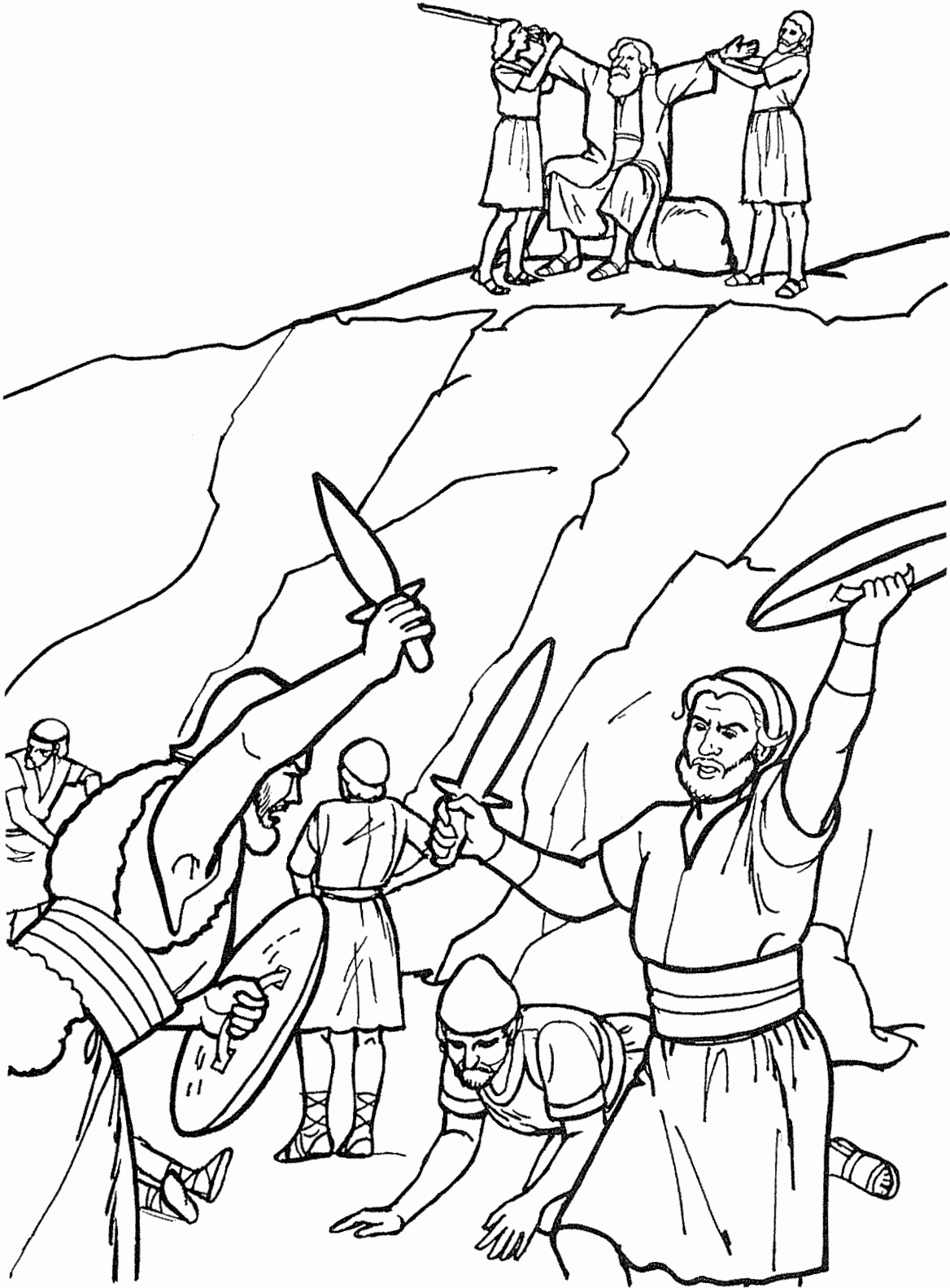
Aaron and Hur hold up Moses' hands